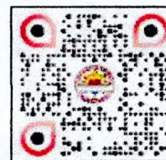
QR for Live-Out