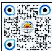
QR for Live-In

To ensure that slots are held for interested participants, we will be very grateful if you can confirm your attendance in advance before the scheduled date. For confirmation, kindly scan the QR Codes or access the link below for your respective Registration Type of choice: